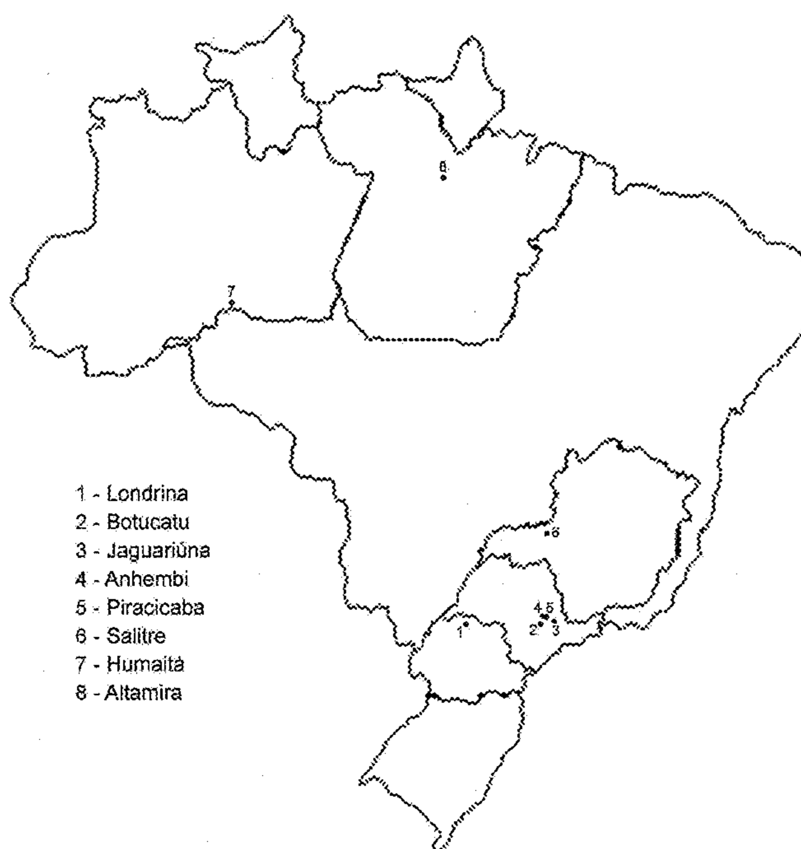
Figure 1 Map of Brazil showing the study sites